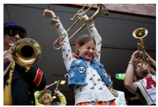
[HONK! as part of the current photo exhibition up in Davis Square]

The HONK! Festival is a good idea coming to fruition. A need had been identified, not only on the part of musicians — of a particular persuasion — who have a penchant for gathering to raise a awareness about issues that need attention. But also a need is there on the part of the audience — not necessarily of any persuasion — to bask in the glow of this unusual phenomenon.