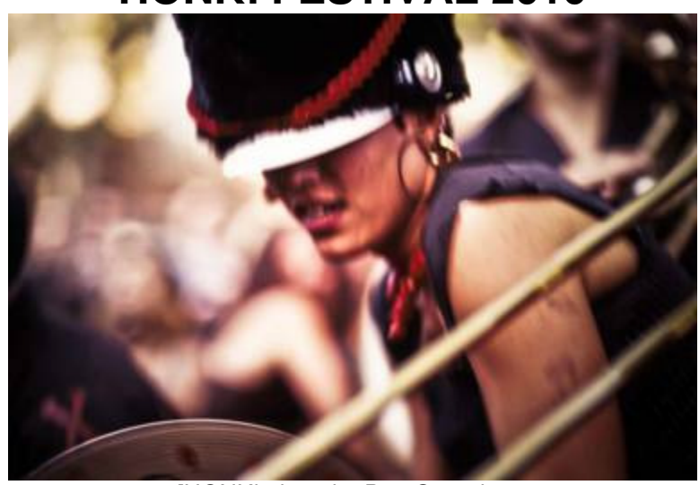
[HONK! photo by Ben Greenberg as part of the current photo exhibition up in Davis Square]